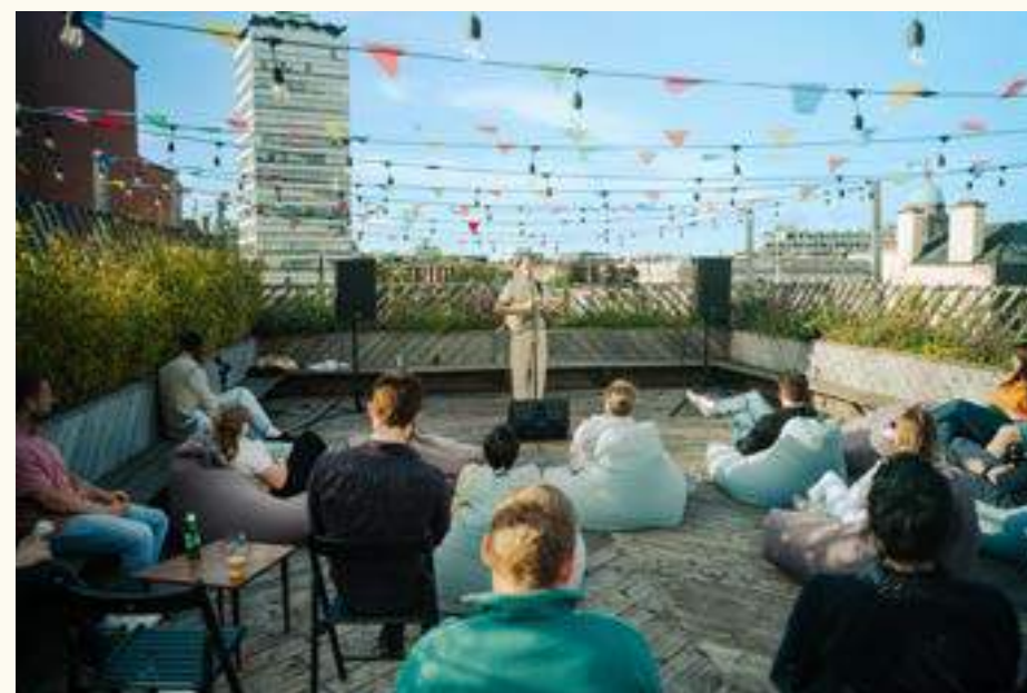
Access to our beautiful rooftop garden