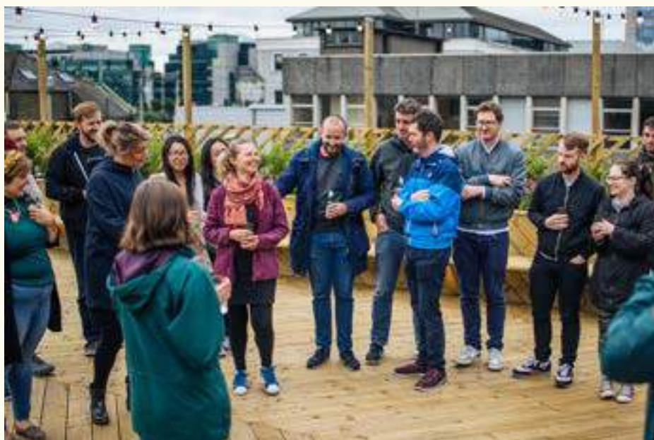
Vibrant monthly event programme