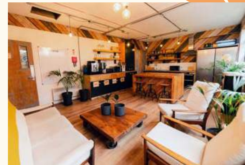
Access to two kitchens