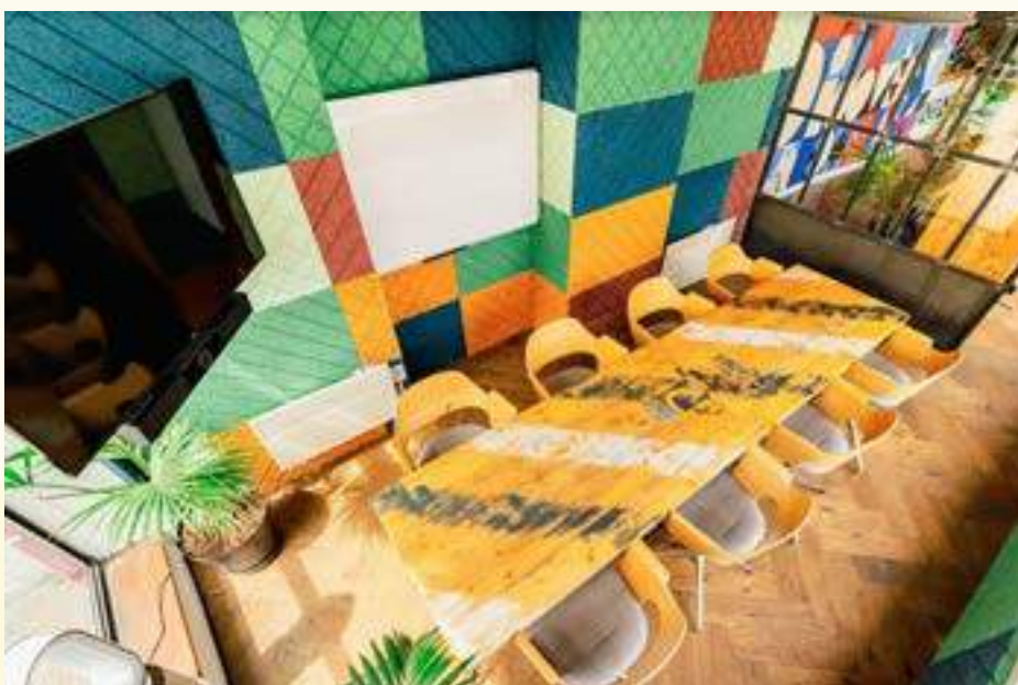
Access to two meeting rooms with 6 hours of free credit monthly