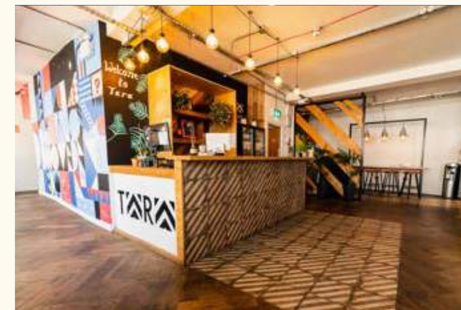
Reception to meet & greet your clients