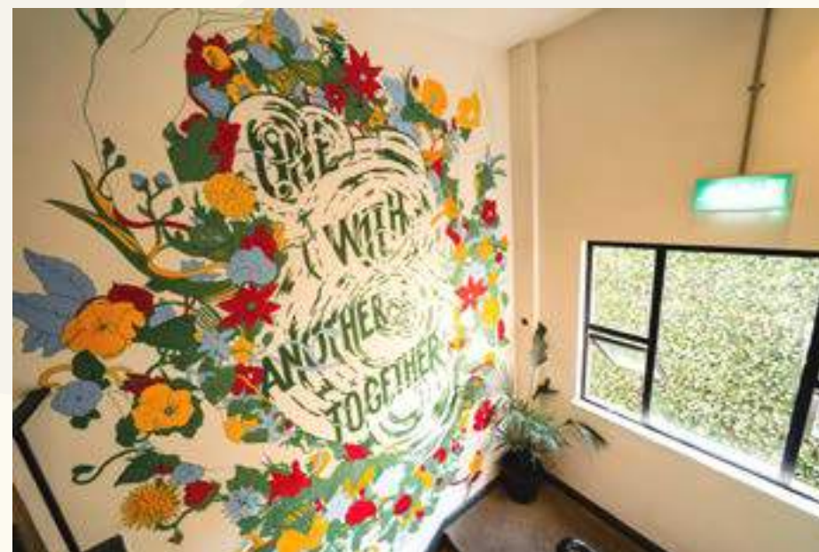
24/7 building access